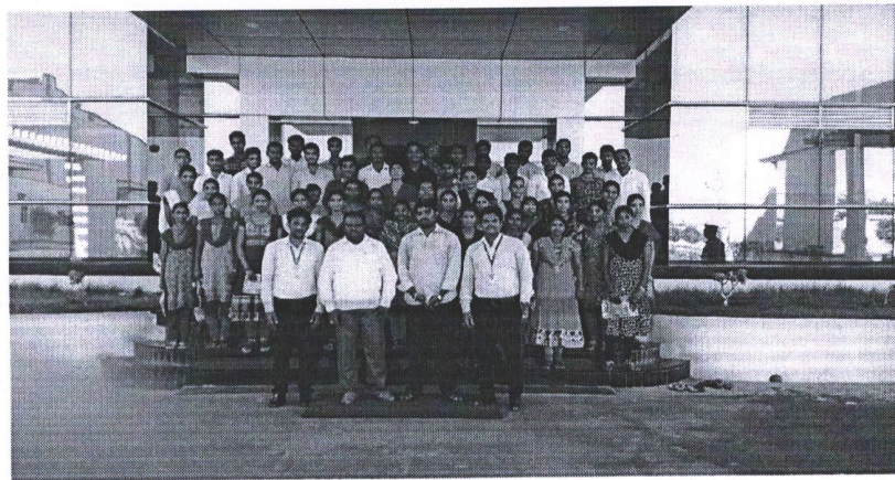
Gathering of students and faculty at entrance of the plant