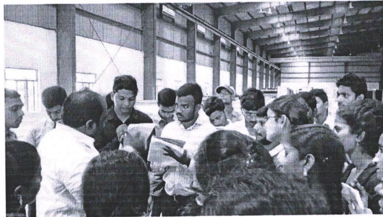
Explanation of the productional activities in the plant