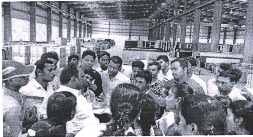
Gathering of students by associate person