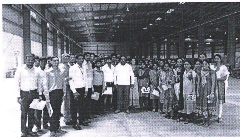
Addressing the students by Associate person